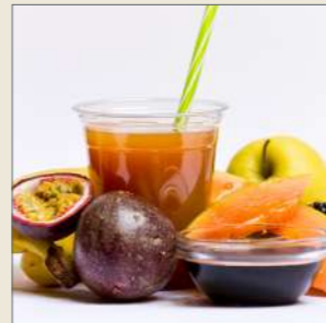
Brazilian sensation £5.90 Pineapple, banana, apple, papaya and passion fruit