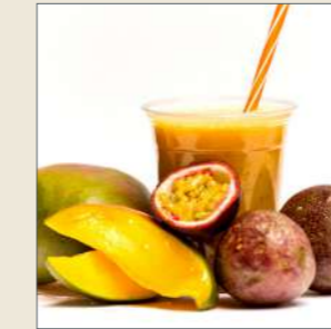
Caribbean passion £5.90 Peaches, passion fruit & mango