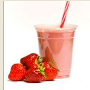
Classic strawberry £5.90 Fresh strawberries & Yoghurt