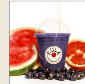
Fat Burner £6.90 Watermelon, grapefruit, lemon and blueberries