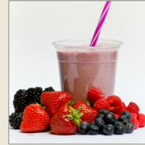
Very berry £5.90 Fresh mixed berries & yogurt