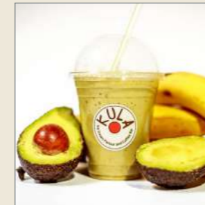
Bananacado £5.90 Bananas, honey, dates, avocado and yogurt