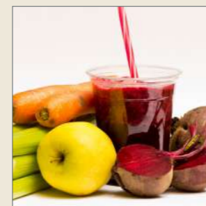
Antioxidant £5.90 Beetroot, carrots & apple