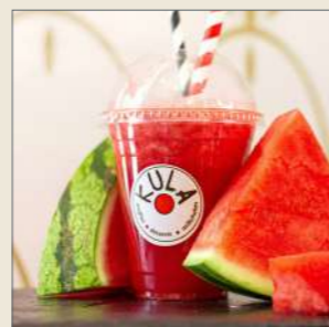
Pure Watermelon £5.90 Freshly crushed watermelon