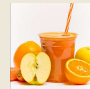
Health Craze £5.90 Carrot, Apple, Orange and ginger