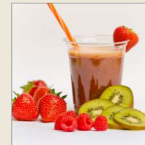
Kiwik Fix £5.90 Kiwi fruit, Raspberry, Strawberry