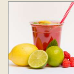
Raspberry lemonade £5.90 Freshly squeezed lemons, sugar, raspberries