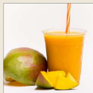
Mango madness £5.50 Fresh mango, mango purée