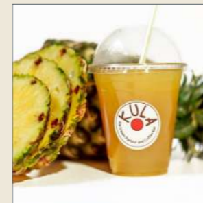
Pinacolada £5.50 Pineapple and coconut juice