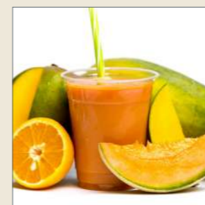
Popeye's papaya £5.90 Papaya, melon, mango, orange.