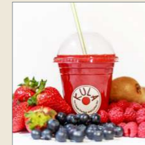
Triple Berry Kiwi £5.90 Strawberries, blueberries, raspberry and kiwis