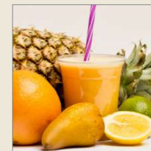
Hollywood diet £5.90 Grapefruit, apple, pineapple, pear, lemon