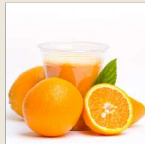
Just oranges £5.50 Freshly squeezed orange juice