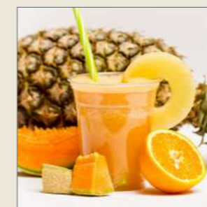
Refuel £5.90 Melon, Orange, Pineapple