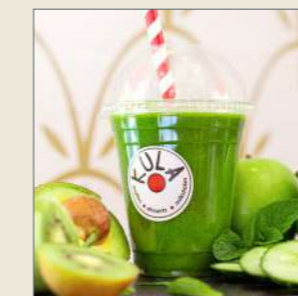
Clean Green £5.90 Kiwis, avocado, apple and cucumber