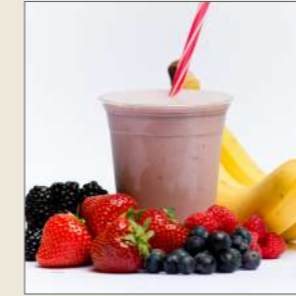
Banana & berry £5.90 Banana, strawberry, raspberry, blueberry